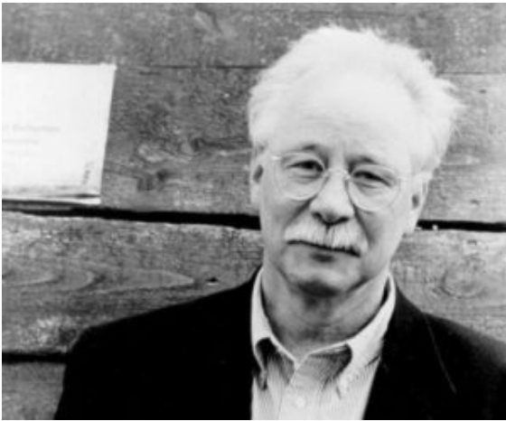
W.G. "Max" Sebald, 1944-2001

seemingly exactly like Sebald, wandering around Europe and recollecting, often at second or third hand, the stories of places and people he encounters. They all deal indirectly with the paradoxical European legacy of Humanism and inhumanity, in which scientific and cultural development sits alongside constant imperialist war and exploitation. He focuses especially on World War Two and the Holocaust, treating this history in comparably non-traditional ways as, for example, recent Nobel laureates Patrick Modiano and Svetlana Alexievich (in 2001, the Nobel Committee chair said that Sebald, along with Derrida, were two recently deceased authors who were under consideration for the prize).