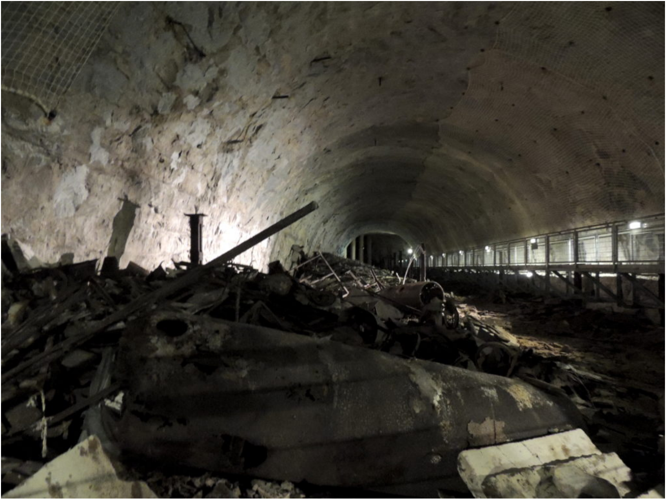
Tunnels where the V-2s were made.

And so, deep in the Harz Mountains, prisoners had to blast tunnels into the earth to create this factory. Thousands of lives were lost and, today, no one really knows about Dora-Mittelbau because what was built there—the rockets—were top secret when America discovered the camp. It was hidden from the press. We didn't want the world to know much about the V-2s, so the horrors of this camp weren't put in the public eye the way that Dachau, Auschwitz, Buchenwald, and Bergen-Belsen were. Even today, the name "Dora-Mittelbau" means very little to most people.