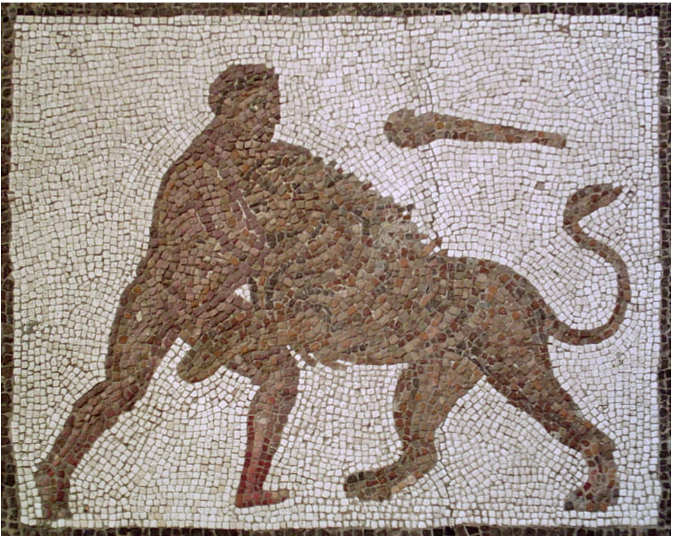
“Heracles Slaying the Lion.” Roman mosaic, Liria, Spain.