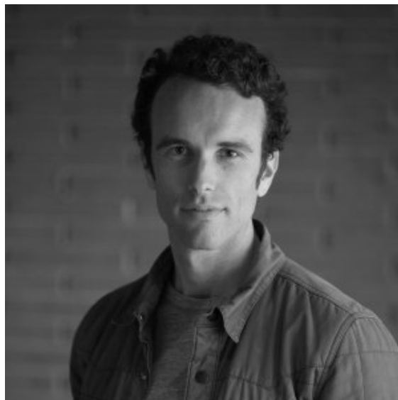
Elliot Ackerman, author of ‘ Red Dress in Black and White ’ (Knopf, May 2020).

I’d love to hear about the writing process for the novel. I think I remember reading that you spent several years on this book. What gave you the idea for a love story set in Istanbul?