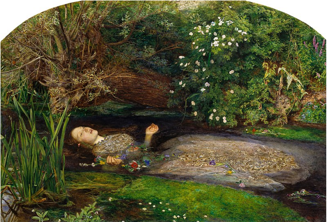
John Everett Millais, "Ophelia," 1851-2.

At long last, Schofield finds the 2 nd , only to realize that they are already in the process of going over the top. In his efforts to reach Colonel MacKenzie with his letter calling off the attack, Schofield, gripped with the madness of obsession, runs across No Man's Land as the shells fall around him, perpendicular to the line of battle, knocking over his comrades and nearly getting killed over and over again. He reaches his goal, delivers his message, and while he is too late to save the first wave of men cut down by German machine guns, he does manage to convince Mackenzie (played by a particularly intense and mustachioed Benedict Cumberbatch) to call off the attack. In the aftermath, he locates Blake's brother, played by none other than Game of Thrones ' Richard Madden (the irony of a Stark playing the brother of a Baratheon will not be lost on fans of the series) and delivers the news of Blake's death. "I am so glad you were with him," Madden says, as he shakes Schofield's hand and tries and fails