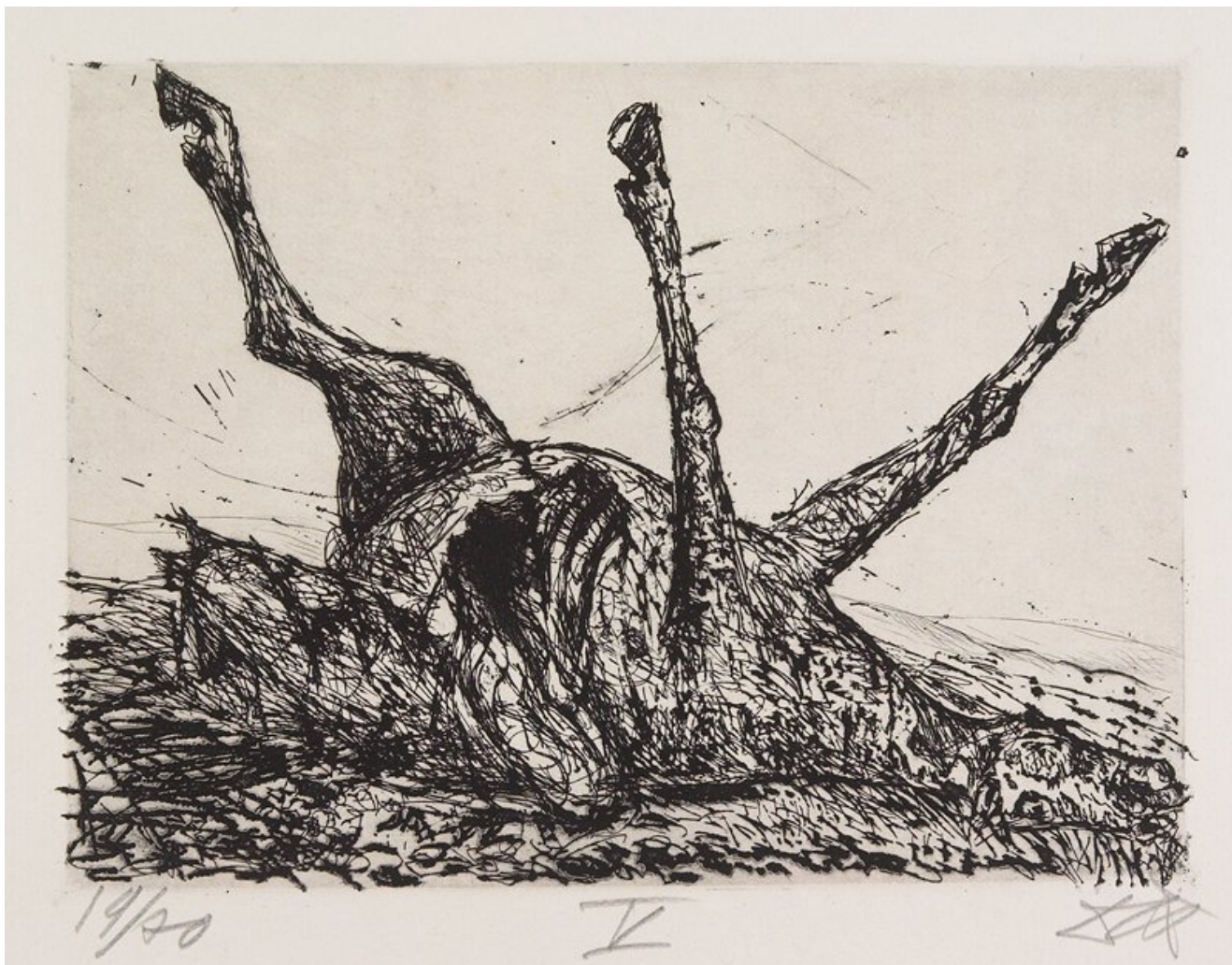
Otto Dix. Horse Cadaver, Plate 5 from 'Der Krieg' (The War), 1924.

chief cause of death in every war before the First World War was from infectious disease, not combat. If one were feeling particularly apocalyptic, one could definitely argue that the number of people felled by the Spanish flu during and after the conflict showcases the continuing role of Pestilence following along in the wake of War.