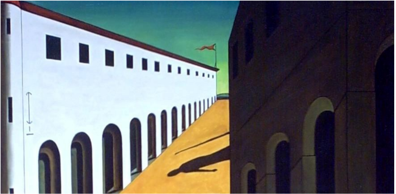
“Melancholy and the mystery of the street” – Painting by George de Chirico, 1914.

The existential horror of solitude. The dread and horror of war, The War, any war. All are displayed here, experienced by the viewer in real time as the protagonist experiences them. As Schofield continues on his journey, the color palette changes again and again and again, from yellow to orange to blue.