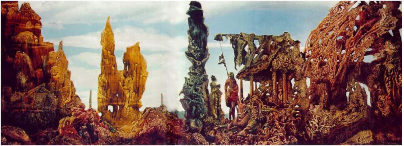
Max Ernst. Europe After Rain II: 1940-42.

There is a moment of dark Great War humor when the two encounter Lieutenant Leslie (Andrew Scott, familiar to viewers of Sherlock as Moriarty) who lends them flare guns (“Throw them back when you’re done, we’re forever out of these”) and reminds them that on the way to their destination, they should “mind the bowing chap”. The Bowing Chap is revealed to be a decaying corpse suspended from barbed wire, a shoutout to the works of the inimitable Otto Dix, whose “Corpse on Barbed Wire” is one of the most memorable pieces of art from the War.