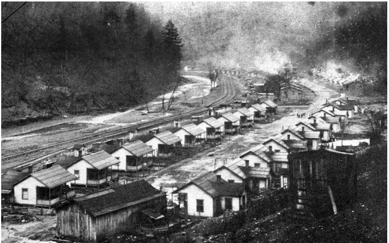
Red Jacket Coal Camp, West Virginia, 1920s

The day of a typical coal miner started at 4 AM, because a miner's shift was sunup to sundown. It was dark when they went into the mine and dark when they came out. The miners ranged in age from 13 to 70 or older, if the elderly could still swing a pick or shovel coal. Prior to the child labor reforms instituted by Teddy Roosevelt, there were many boys as young as five working in the picking sheds, spending twelve hours a day sorting slate and other impurities from the coal as it came out of the mines. Boys of ten could go into the mines with their fathers, since their small size allowed them to go into "low coal" tunnels of 18 inches' height or less. It should be noted that more unscrupulous companies continued to utilize child labor well into the 1920s in open defiance of the law, a practice that only ended definitively when FDR came into office. Within the mines, conditions were horrific. No breathing apparatus was available, so the miners were forced to inhale every particle of rock dust and powdered coal they