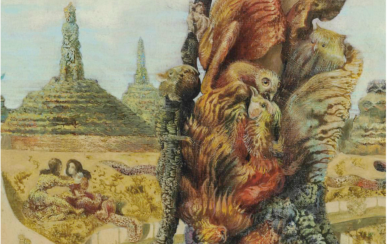
Max Ernst's The Stolen Mirror (1941)

As many artists have noted, memory underpins imagination. Creating new artistic and intellectual works depends critically on the reshaping of what has gone before.