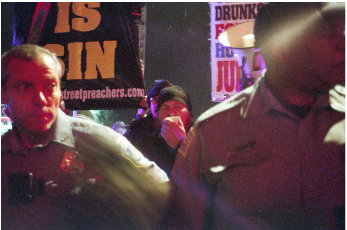
Westboro protesters at Comet Pizza

The evangelist ignored the commotion, gaze fixed on me. I remembered—these people protested soldiers’ funerals. Dead soldiers. These wild-eyed men with their long beards activated an old familiar heat in my chest. I moved through the crowd. Music played, and my friends dancing. Beat and rhythm carried