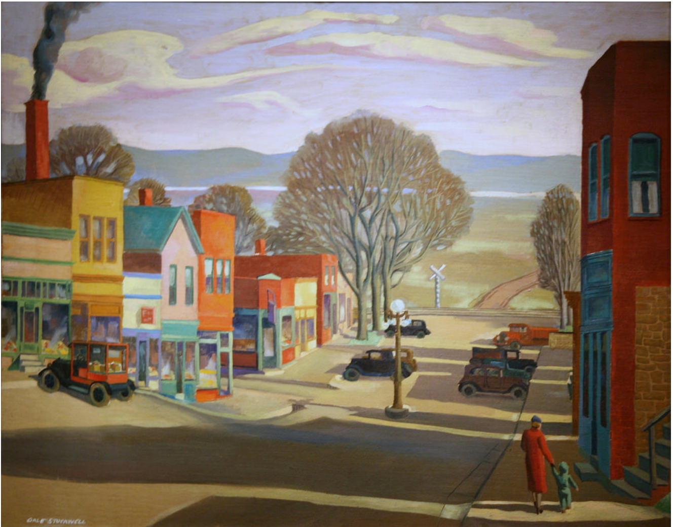
Gale Stockwell, Parkville, Main Street, 1933.

blocked by a low-hanging tree limb. He chuckled. But finding you was good fortune. I hope all the festivities won't inconvenience you unduly.