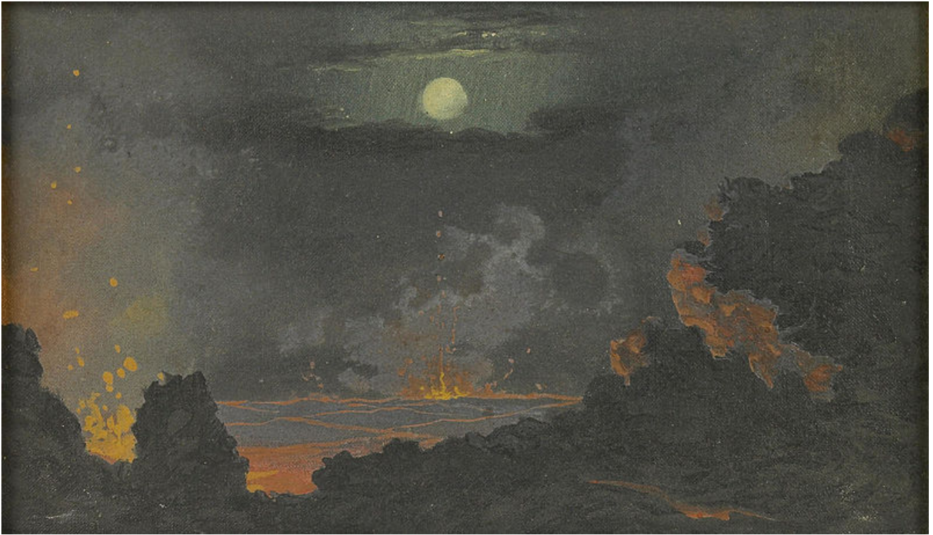
Jules Tavernier, Heart of a Volcano Under the Full Moon, 1888.

I awake to the moon beaming unto a lonely bed, find you out back where dreams smear on a blurry canvas of recollection, and ghosts rise from wooded corners of truth.