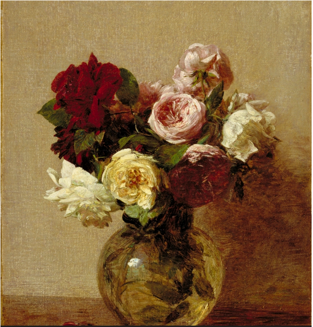
Still Life with Roses of Dijon, 1882, Ignace-Henri-Jean-Théodore Fantin-Latour (French, 1836–1904)

To some people outside our circle, Charles Rist was seen as a saintly hero. Charles Rist, our grandfather, was a famous economist, and vice-governor at La Banque de France. He was among the first to sign Zola's "J'Accuse," in a public letter defending Alfred Dreyfus. It was a courageous act for a man of the establishment. For this gesture, he was condemned by some as a nefarious sinner.