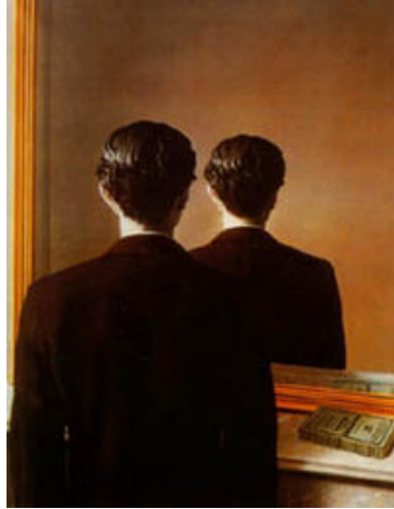
René Magritte, Not to Be Reproduced, 1937