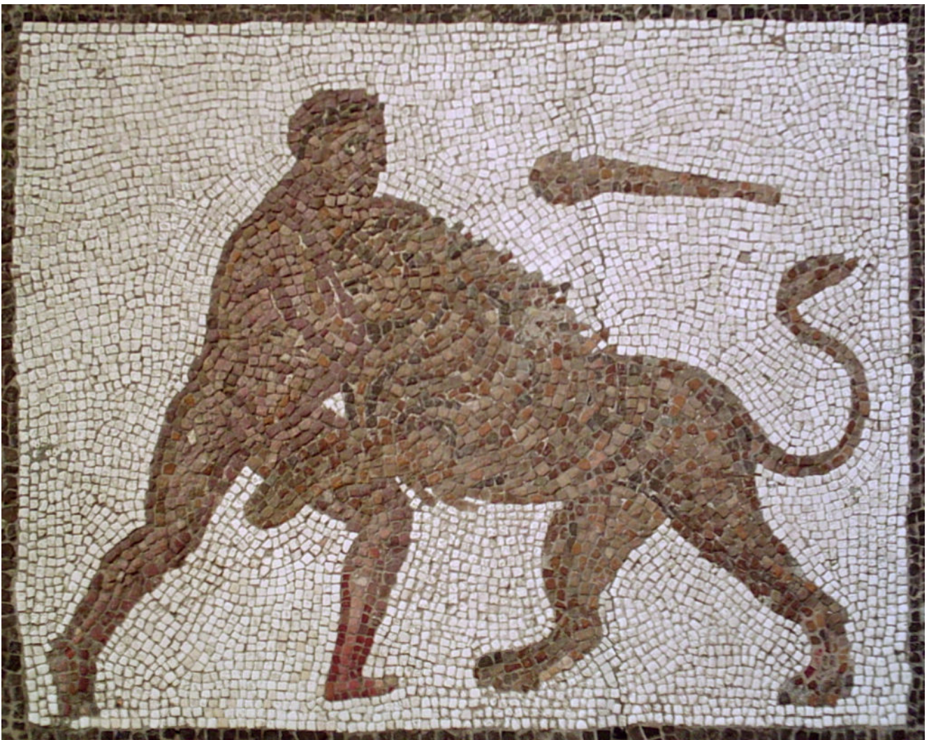
"Heracles Slaying the Lion." Roman mosaic, Liria, Spain.

Her name was Henrietta. She was a golden lioness, born on the grasslands of Africa, sired by a black-maned king of the savannah. She was still a cub when poachers decimated her pride, killing the lions for their teeth and claws and bones. The cubs were rounded up and sold on the black market. She became the pet of an Emirati sheikh, who later sold her to a Miami cocaine lord who enjoyed walking her on a leash amid the topiary beasts of his estate, ribbons of smoke curling from his Cuban cigar.