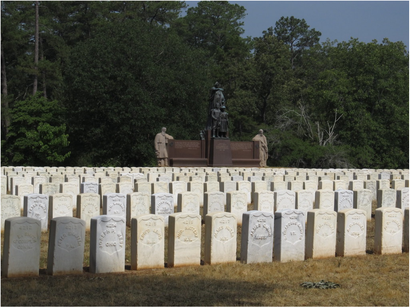
Andersonville National Cemetery