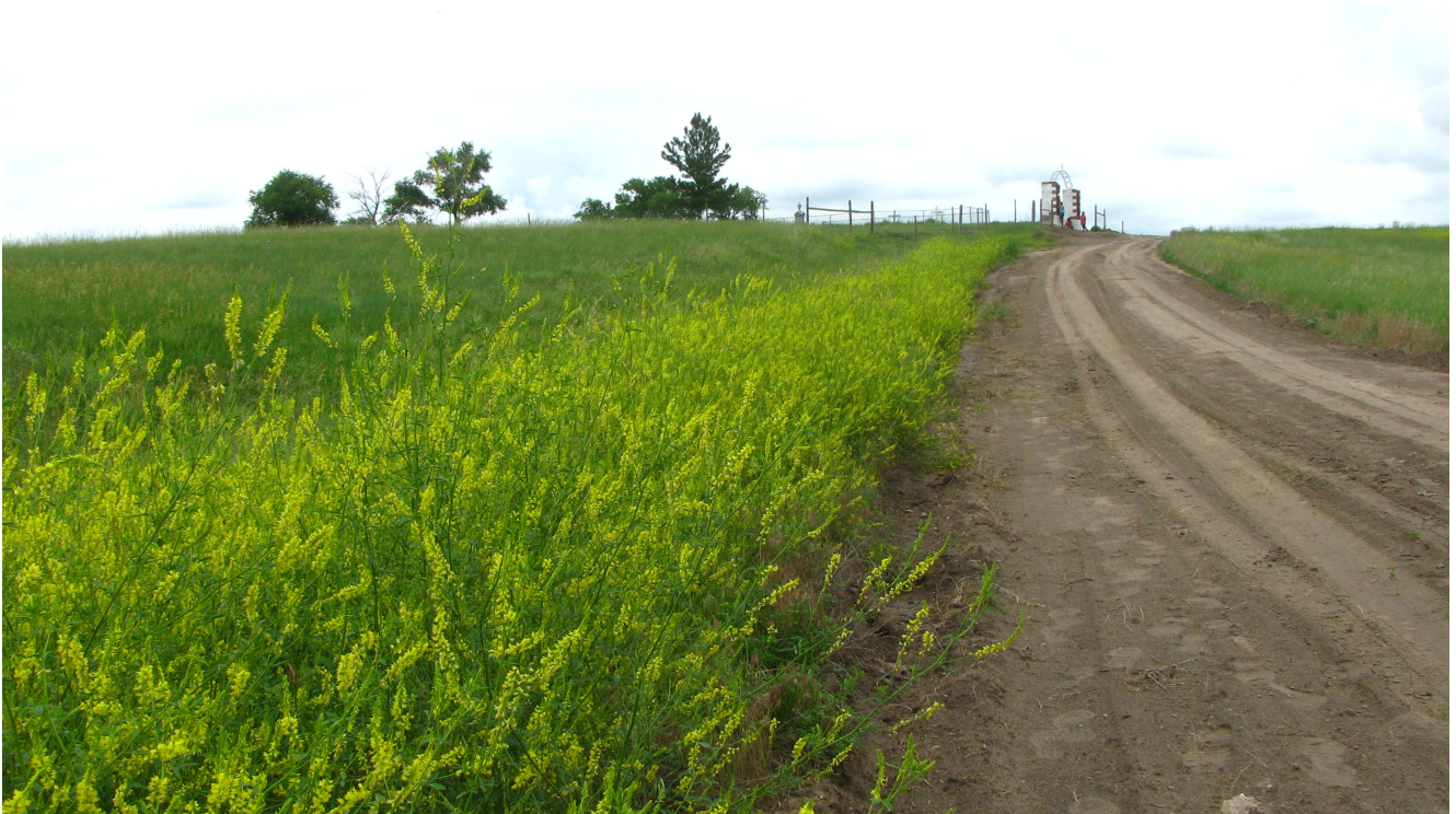
Wounded Knee Massacre Burial Site

Illness, violence, forgiveness: these three. They have long memories.