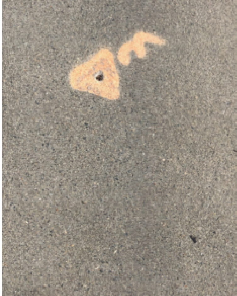
TAG EVERY WALL / image by Amalie Flynn