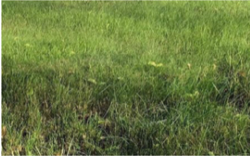
THE LUSHEST GRASS / image by Amalie Flynn