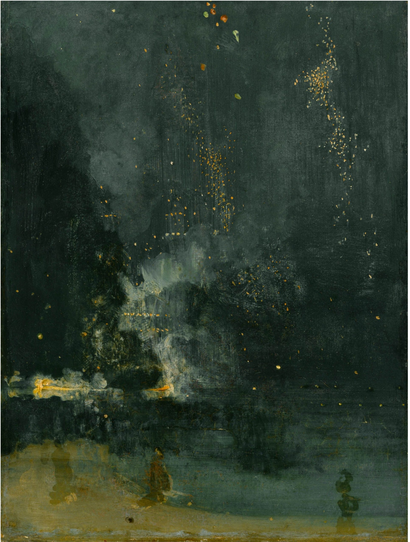
James Abbott McNeill Whistler, Nocturne in Black and Gold – The Falling Rocket, 1874

I met the Lieutenant at a diplomatic reception at our embassy.