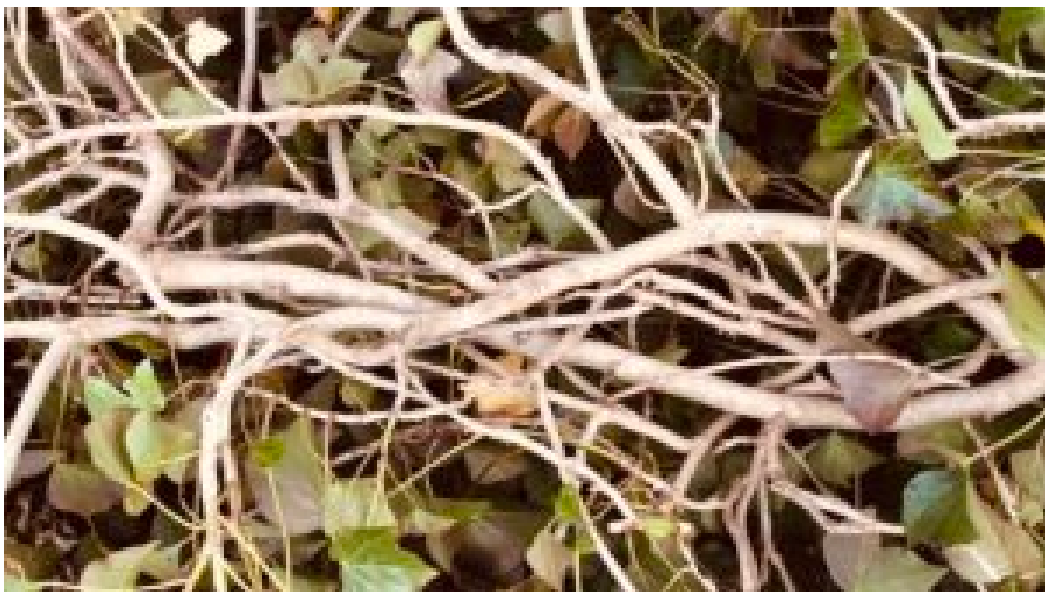
CAPILLARIES OF ROOTS / image by Amalie Flynn