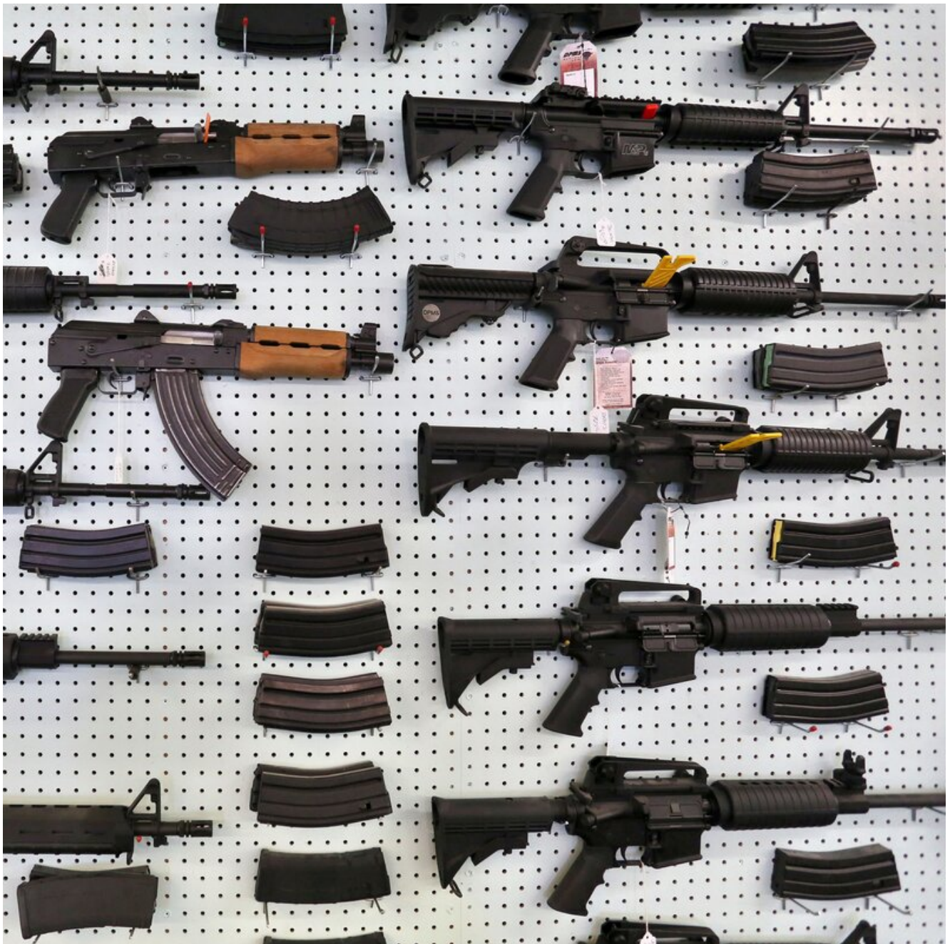
Guns are displayed at Dragonman's, an arms seller east of Colorado Springs, Colo.

money went to support the Republican Presidential candidate and Republican Congressional races in 2020. Undoubtedly, the NRA is one of the most powerful lobbies in Washington that rates political candidates targeting candidates that are for gun control. Essentially, it uses the Second Amendment as cover to promulgate gun dissemination and profits on gun sales, much at the cost of gun deaths of Americans.