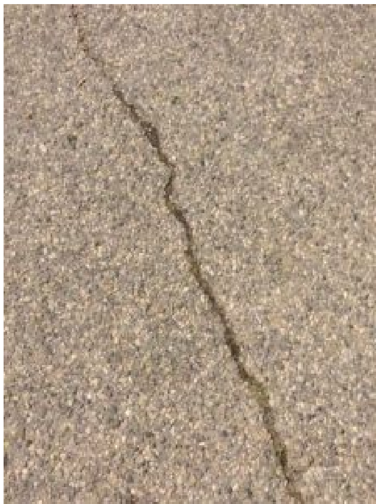
THE FAULT LINES / image by Amalie Flynn