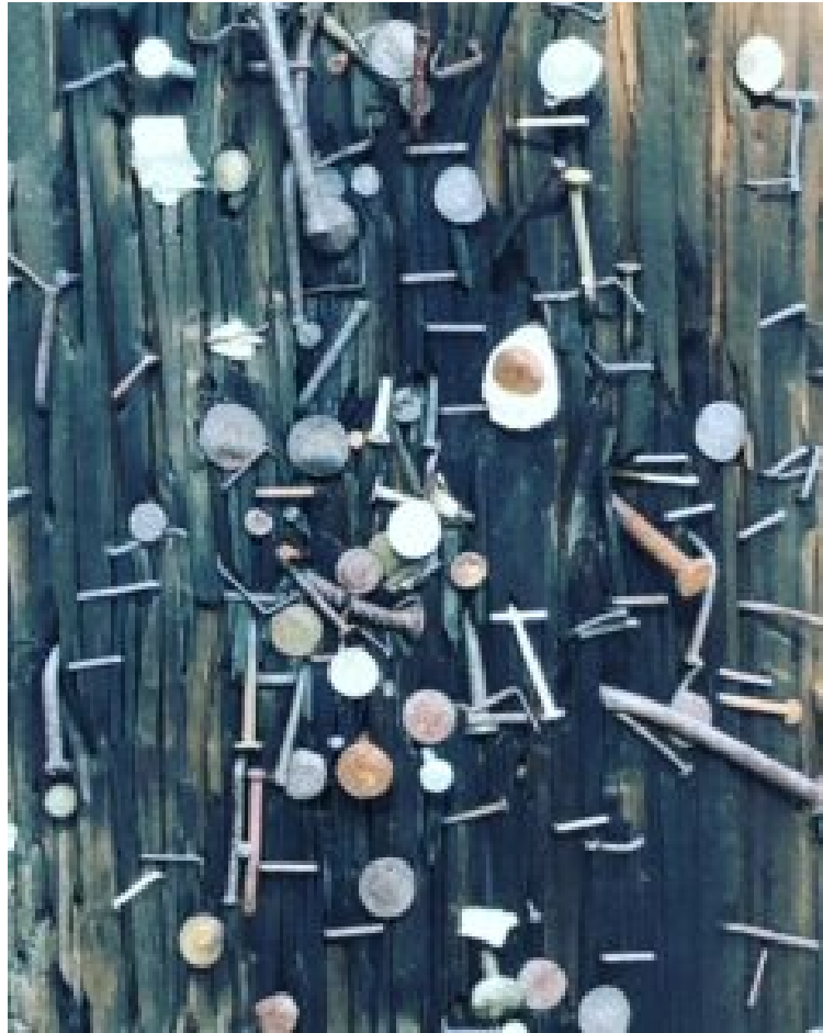
WAR HAS DONE