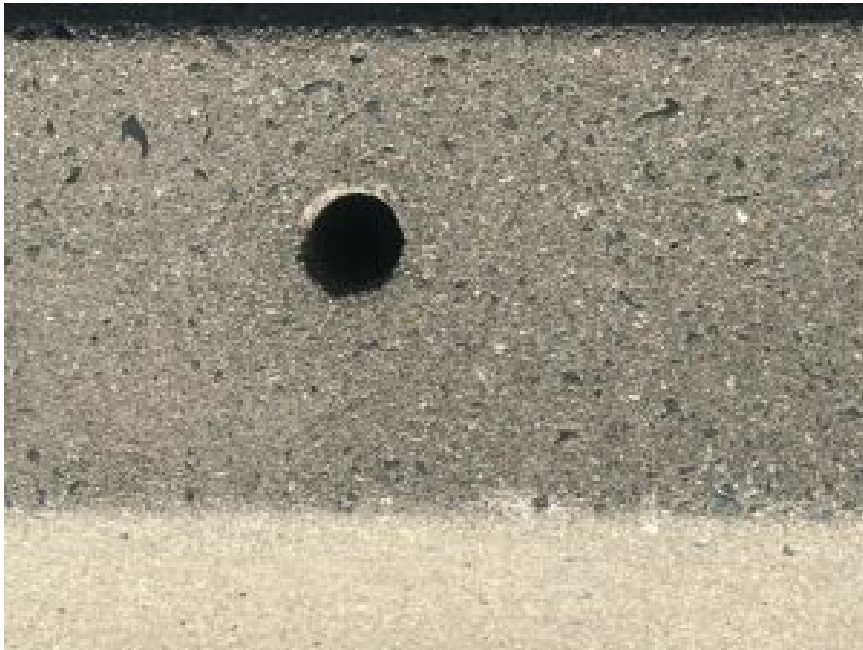
HOLE IN ME / image by Amalie Flynn