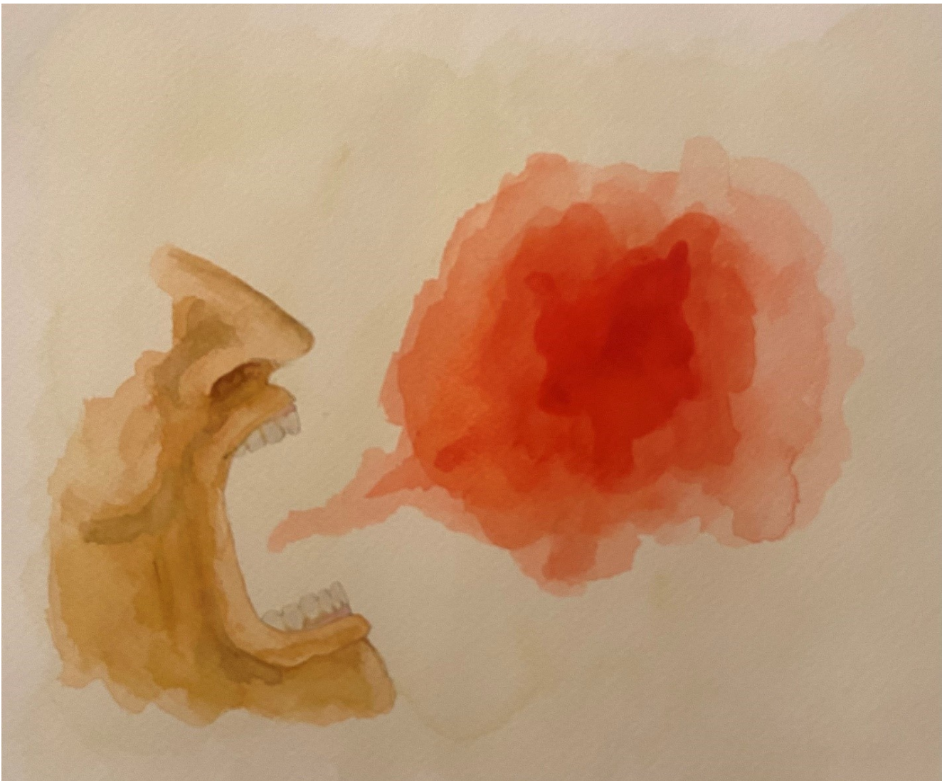
“Selvvalgt ensomhed/Self-selected Loneliness”

The early pictures set the tone for much of the rest of the year. “Angsten og Vreden del. 1/The Anxiety and the Anger part. 1” is dated January 2, 2022, and depicts a fragment of a face in profile, just a nose and a wide-open mouth in a scream, with a ball of reddish-colored smoke emanating from the mouth.