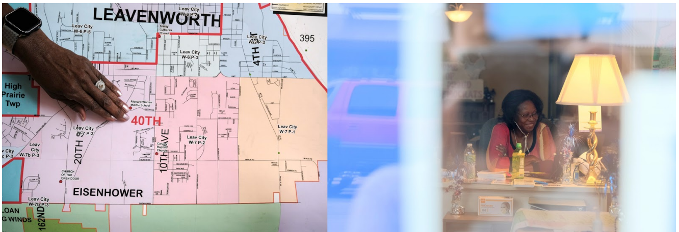
L: Joana Scholtz points out the political leanings in different neighborhoods of District 40, outlined in red, on a map that shows how the borders have been gerrymandered, on September 22, 2020 at campaign headquarters in Leavenworth, Kansas.