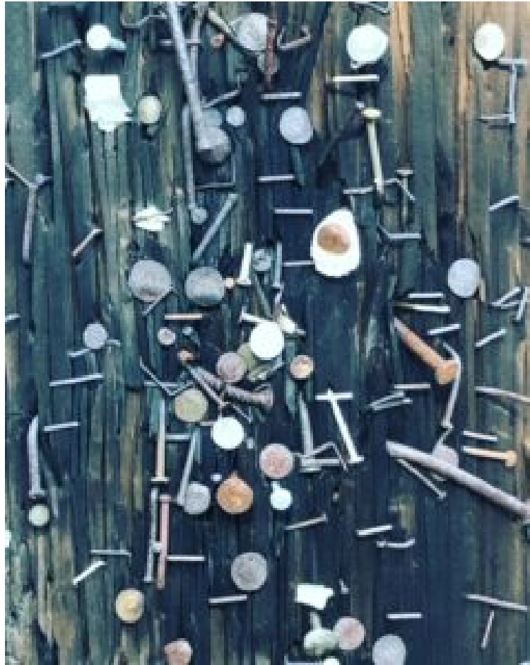
WAR HAS DONE