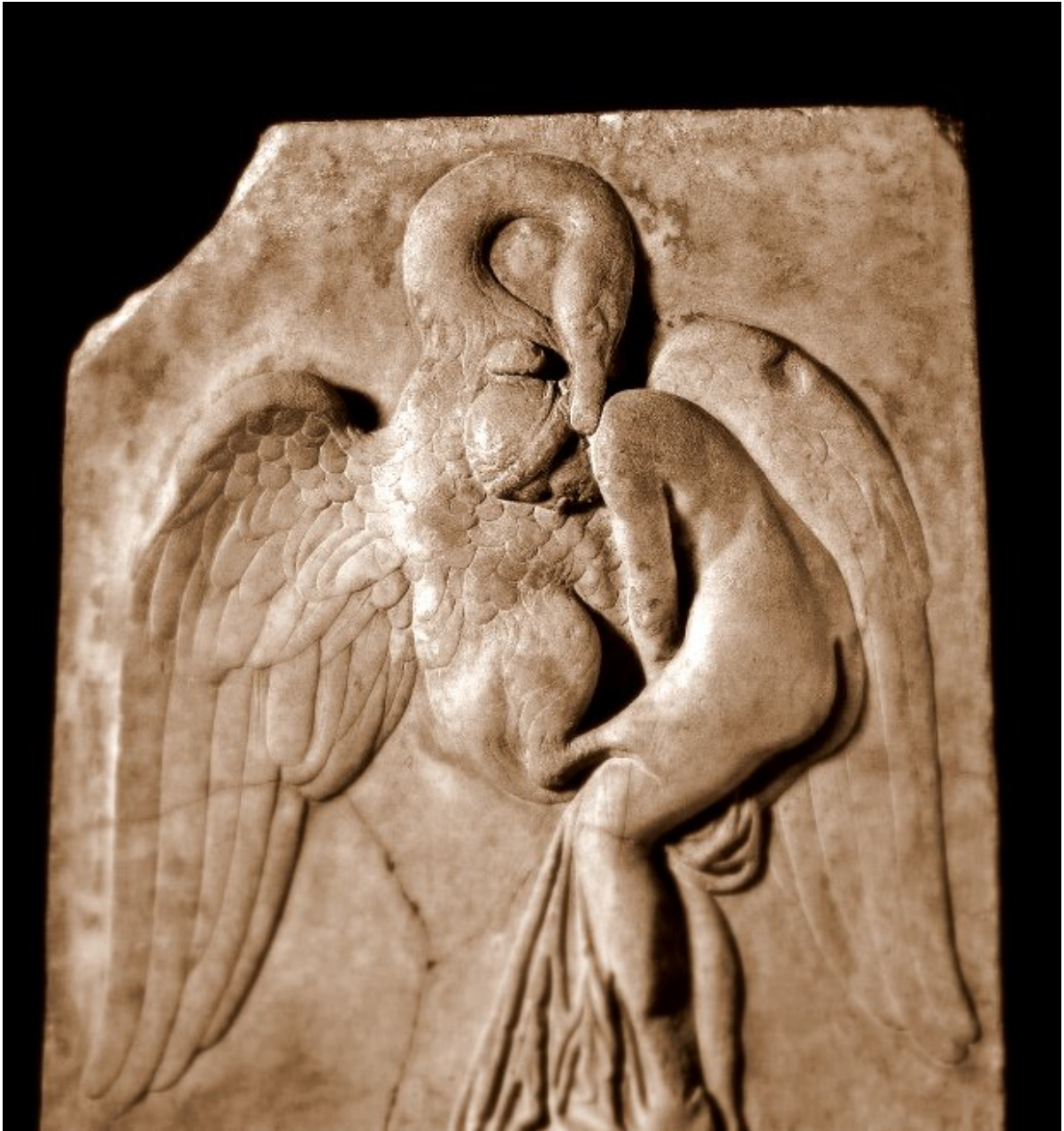
Leda and the swan, from ruins at Argos.

For the next six months, we tried to remember. We took long walks in the steel blue fog of the Great Smoky Mountains, but only the ravens and the falling leaves spoke. We drove to Roanoke Island and waded in the sea foam, but the cold bit our toes and a massive cloud formed, dumping hard wet rain atop our two heads.