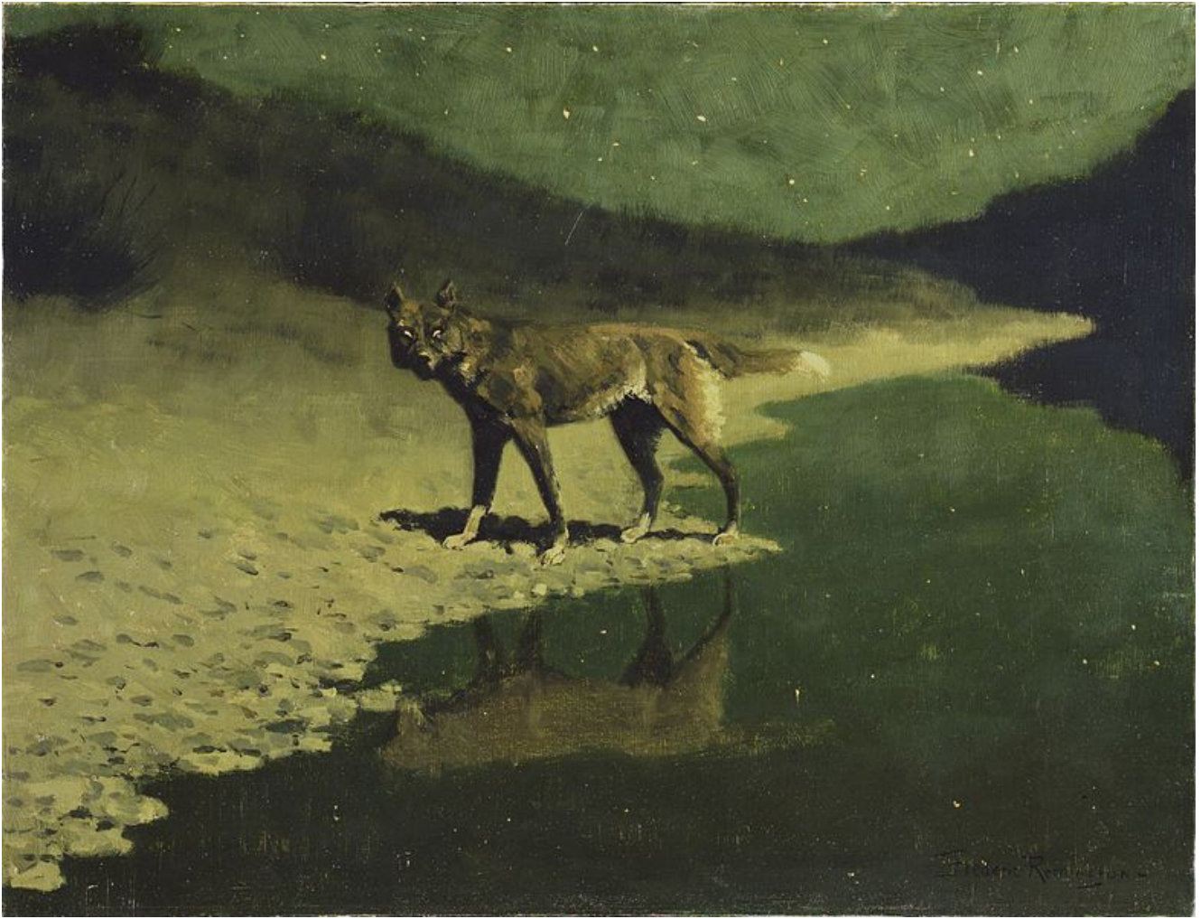
Frederic Remington. Moonlight, Wolf , 1909.

The entire compound is preternaturally still. The yard, the woods, the porch cluttered with gnarled geraniums and fraying furniture; the rickety red barn with its animal pens clinging to its side for dear life; the piles of lumber and rusting machinery—all are as somnolent as the snore of a summer bee.