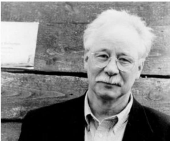
W.G. "Max" Sebald, 1944-2001

seemingly exactly like Sebald, wandering around Europe and recollecting, often at second or third hand, the stories of places and people he encounters. They all deal indirectly with the paradoxical European legacy of Humanism and inhumanity, in which scientific and cultural development sits alongside constant imperialist war and exploitation. He focuses especially on World War Two and the Holocaust, treating this history in comparably non-traditional ways as, for example, recent Nobel laureates Patrick Modiano and Svetlana Alexievich (in 2001, the Nobel Committee chair said that Sebald, along with Derrida, were two recently deceased authors who were under consideration for the prize).