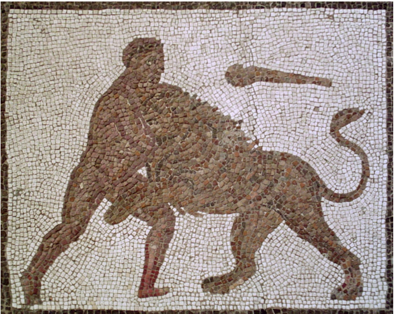
“Heracles Slaying the Lion.” Roman mosaic, Liria, Spain.

Her name was Henrietta. She was a golden lioness, born on the grasslands of Africa, sired by a black-maned king of the savannah. She was still a cub when poachers decimated her pride, killing the lions for their teeth and claws and bones. The cubs were rounded up and sold on the black market. She became the pet of an Emirati sheikh, who later sold her to a Miami cocaine lord who enjoyed walking her on a leash amid the topiary beasts of his estate, ribbons of smoke curling from his Cuban cigar.