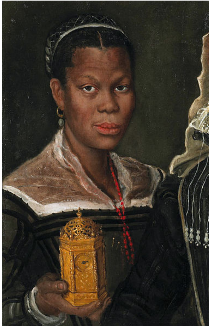
Annibale Caracci, circa 1580s.