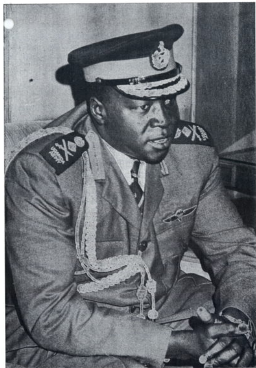
HIS EXCELLENCY GENERAL IDI AMIN DADA President of the Republic of Uganda