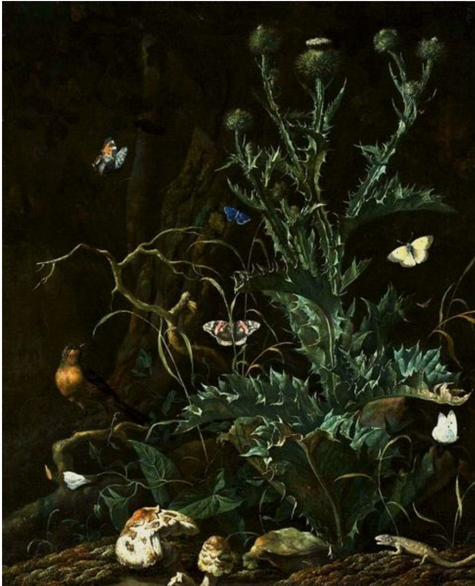
Abraham Begeyn, "Still Life with Thistle," circa 1650s.

A storm rumbles off across the valley and sunlight breaks through in its wake. The dirt road is scattered with shining blue and silver portals. He remembers walking with his mother, holding her hand, imagining being pulled through them into that underworld and drifting weightlessly. He remembers her voice, excited to show him something beautiful. How she motioned ahead: "Oh, sweetie, look!"