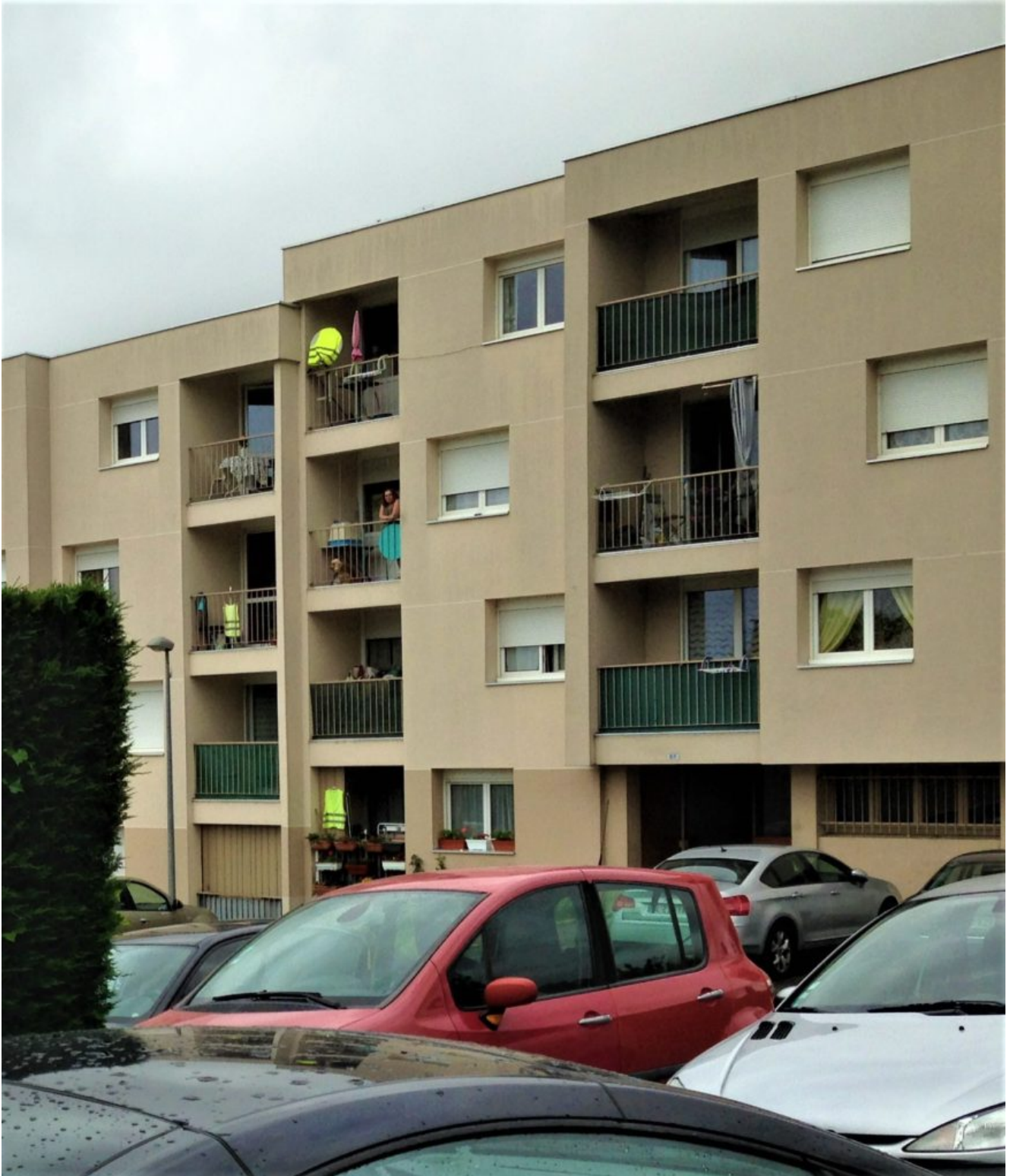
Outside of Lyon, France, quarantined Yellow Vest protestors hang their symbols outside their windows.

If we believe that The Plague can only stand for political totalitarianism or health crises, we will have too quickly dismissed one of the essential functions of the book, which is to provide a blueprint for both identifying and overcoming