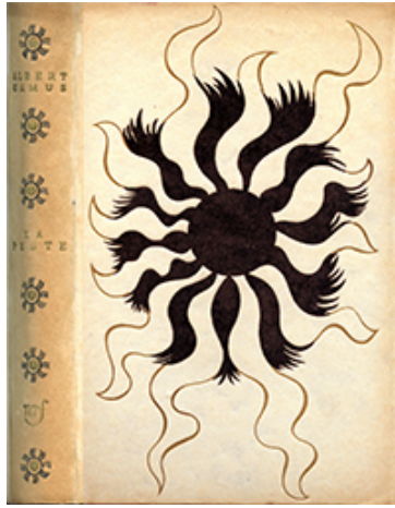
Cover of the French 1947 special edition of The Plague . Cover design by Mario Prassinós. Editions Gallimard.

The Plague tells the story of a bubonic plague outbreak that strikes the French-Algerian town of Oran, decimating the population. It begins with sick rats coming out to die in the streets. When the rats disappear, the disease moves on to infect humans. At first, most of the inhabitants, with the exception of the character of Dr. Bernard Rieux, refuse to believe that the disease is dangerous. Rieux works tirelessly not only to save sick victims, but also to mobilize a movement against the plague by calling on others to help in the fight against it. As the city closes its gates, Tarrou, Grand, le Père Paneloux, Rambert, Castel, and Othon are among the characters who risk their lives to care for the victims of the unrelenting epidemic.