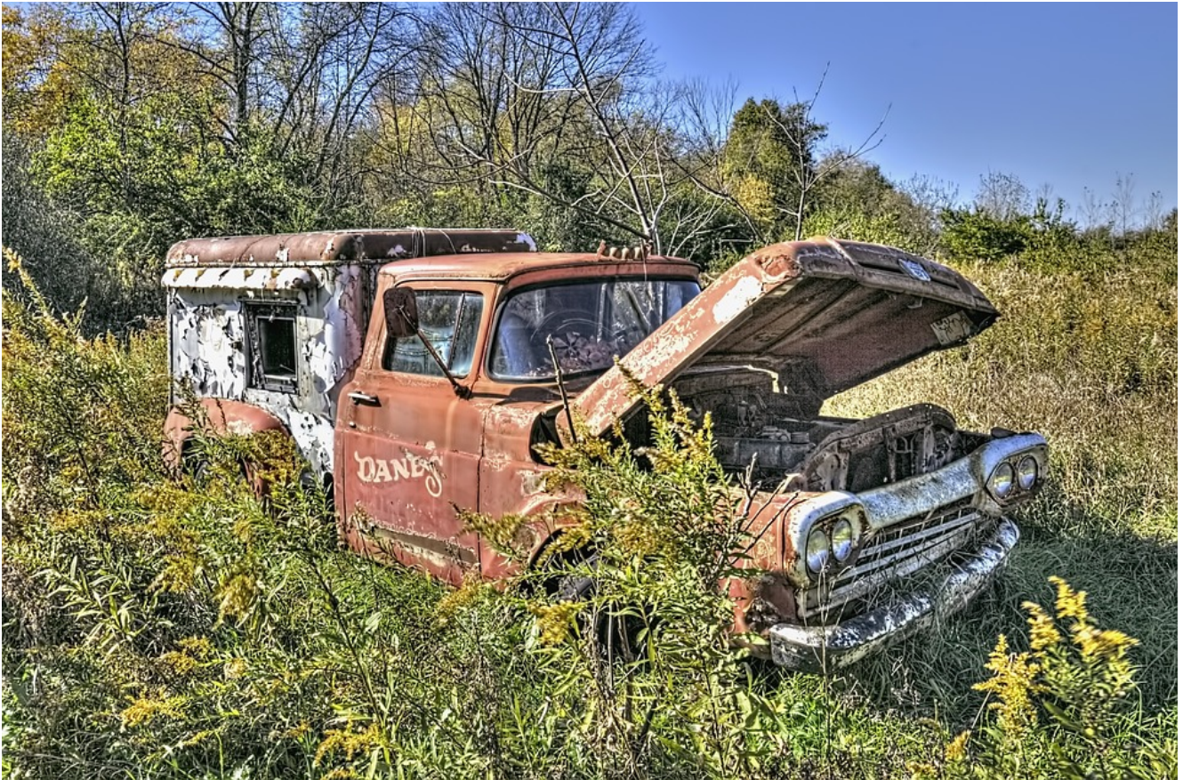
Ford Ice Cream Truck