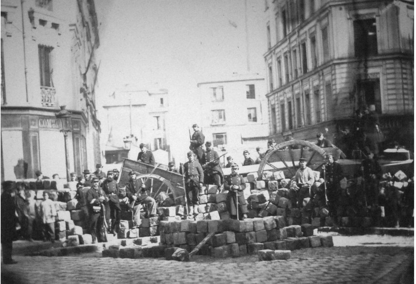
"Exposition La Commune de Paris à l'Hôtel de Ville de Paris," 1871.