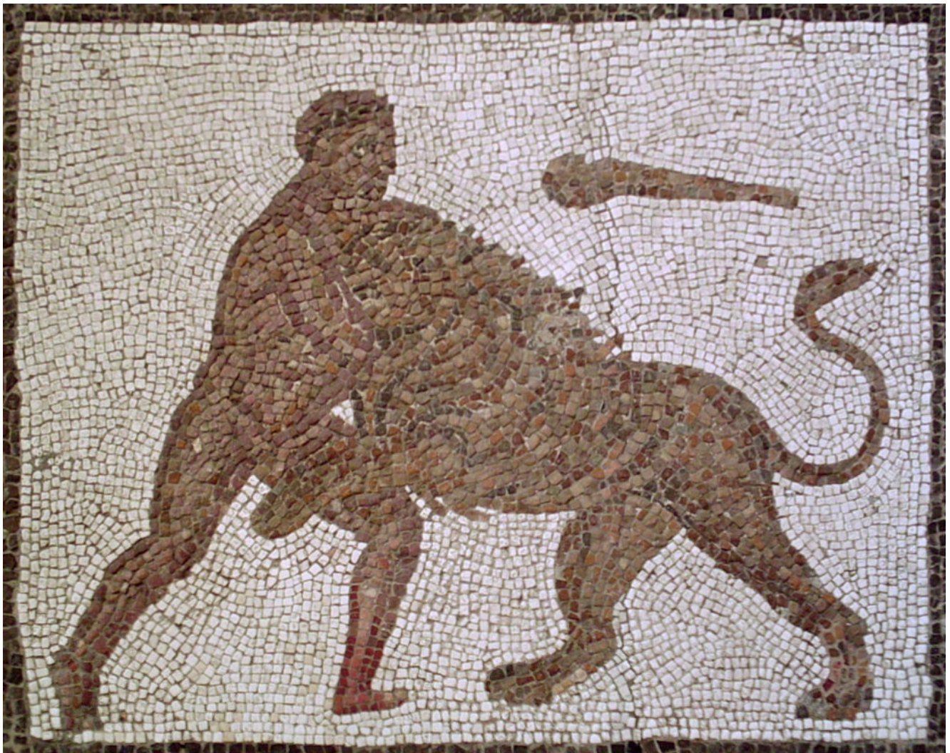
“Heracles Slaying the Lion.” Roman mosaic, Liria, Spain.

Her name was Henrietta. She was a golden lioness, born on the grasslands of Africa, sired by a black-maned king of the savannah. She was still a cub when poachers decimated her pride, killing the lions for their teeth and claws and bones. The cubs were rounded up and sold on the black market. She became the pet of an Emirati sheikh, who later sold her to a Miami cocaine lord who enjoyed walking her on a leash amid the topiary beasts of his estate, ribbons of smoke curling from his Cuban cigar.