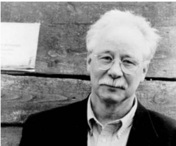
W.G. "Max" Sebald, 1944-2001

seemingly exactly like Sebald, wandering around Europe and recollecting, often at second or third hand, the stories of places and people he encounters. They all deal indirectly with the paradoxical European legacy of Humanism and inhumanity, in which scientific and cultural development sits alongside constant imperialist war and exploitation. He focuses especially on World War Two and the Holocaust, treating this history in comparably non-traditional ways as, for example, recent Nobel laureates Patrick Modiano and Svetlana Alexievich (in 2001, the Nobel Committee chair said that Sebald, along with Derrida, were two recently deceased authors who were under consideration for the prize).