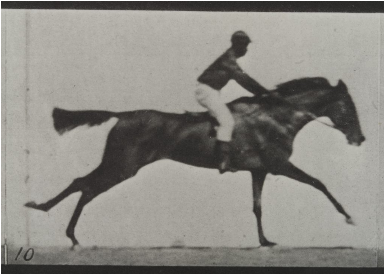
1887. Eadweard Muybridge. Wellcome Gallery, London.