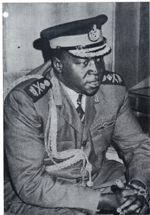
HIS EXCELLENCY GENERAL IDI AMIN DADA President of the Republic of Uganda