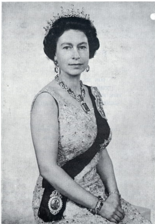
HER MAJESTY QUEEN ELIZABETH II of Great Britain and Northern Ireland, Head of the Commonwealth

he sent world leaders. In a correspondence with Queen Elizabeth, he sympathized with England's economic woes and volunteered to send "a cargo ship full of bananas to thank you for the good days of the colonial administration." In Uganda, the killings began nearly as soon as Amin came to power. Concerned about a coup, he purged the army of soldiers from Acholi and Langi tribes, two ethnic groups allied with Milton Obote. He established the State Research Bureau, an intelligence agency infamous for torture. He killed those who threatened his power. He killed those who might threaten his power. He killed those who didn't threaten his power at all. Bodies were tossed into the lakes, and the crocodiles grew fat. After fleeing Uganda, one of Amin's former aides told Time magazine, "'You are walking, and any creature making a step on the dry grass behind you might be an Amin man. Whenever you hear a car speeding down the street, you think it might suddenly come to a stop – for you. I finally fled, not because I was in trouble or because of anything I did, but out of sheer fear. People disappear. When they disappear, it means they are dead.'"