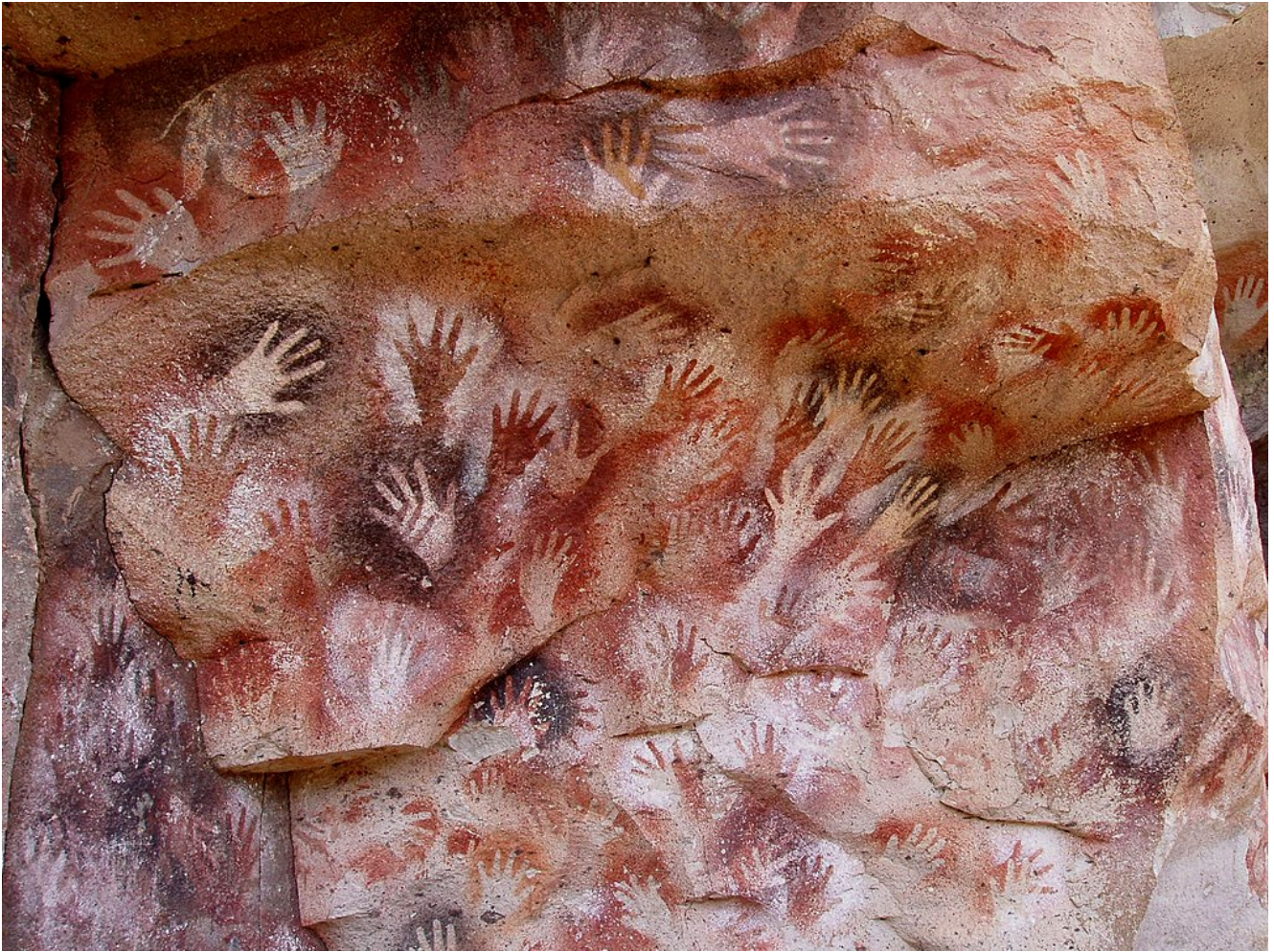
Hands at the Cuevas de las Manos upon Río Pinturas, near the town of Perito Moreno in Santa Cruz Province, Argentina.

In my childhood, television was a great unifier, for there existed a limited choice of three television networks, discounting PBS. But even if we were watching the same programming, television had begun to shape and change all of our lives—and our democracy—for the Vietnam War was broadcast into our homes every night as was the coverage of Nixon's downfall and resignation. Politics reached beyond the nightly news and entered drama and comedy. Programming like All in the Family provided a shrill echo of conservative politicians in its portrayal of bigoted Archie Bunker as he faced an America that looked, in his eyes, nothing like the one he had known before. M*A*S*H , a laughter-heavy depiction of an army surgical unit set on the frontlines of the Korean War began airing in 1972 and offered a not-so-subtle editorial about the