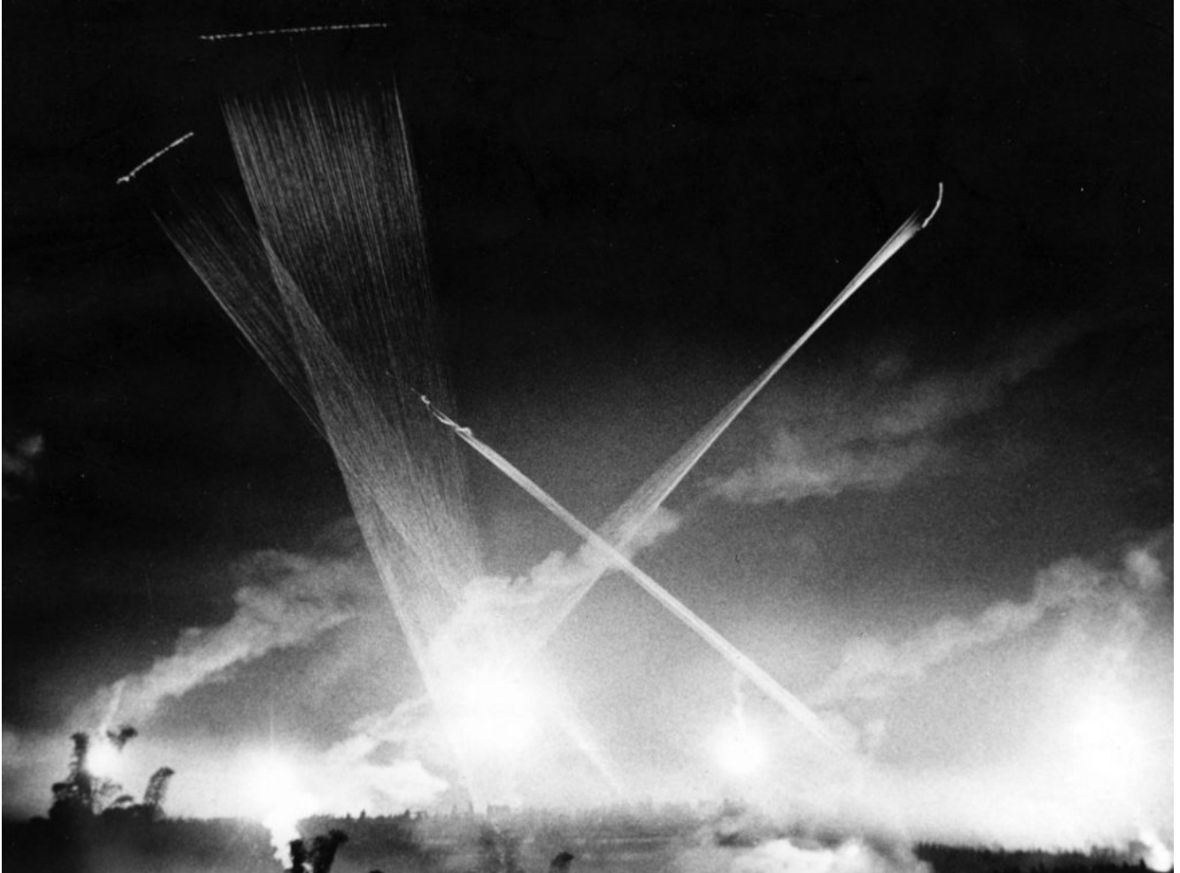
Tracer round trajectories, Vietnam war.

There were only a few days left in the month and the major, after all, had said there was nothing scheduled. It looked like I might skate on this yet. "OK, sir," I said, "you've got a deal."