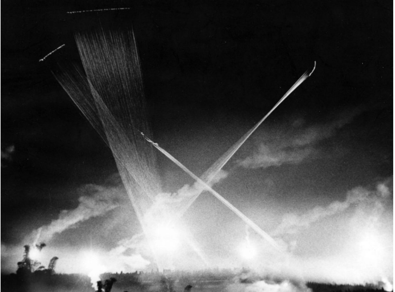
Tracer round trajectories, Vietnam war.

There were only a few days left in the month and the major, after all, had said there was nothing scheduled. It looked like I might skate on this yet. "OK, sir," I said, "you've got a deal."