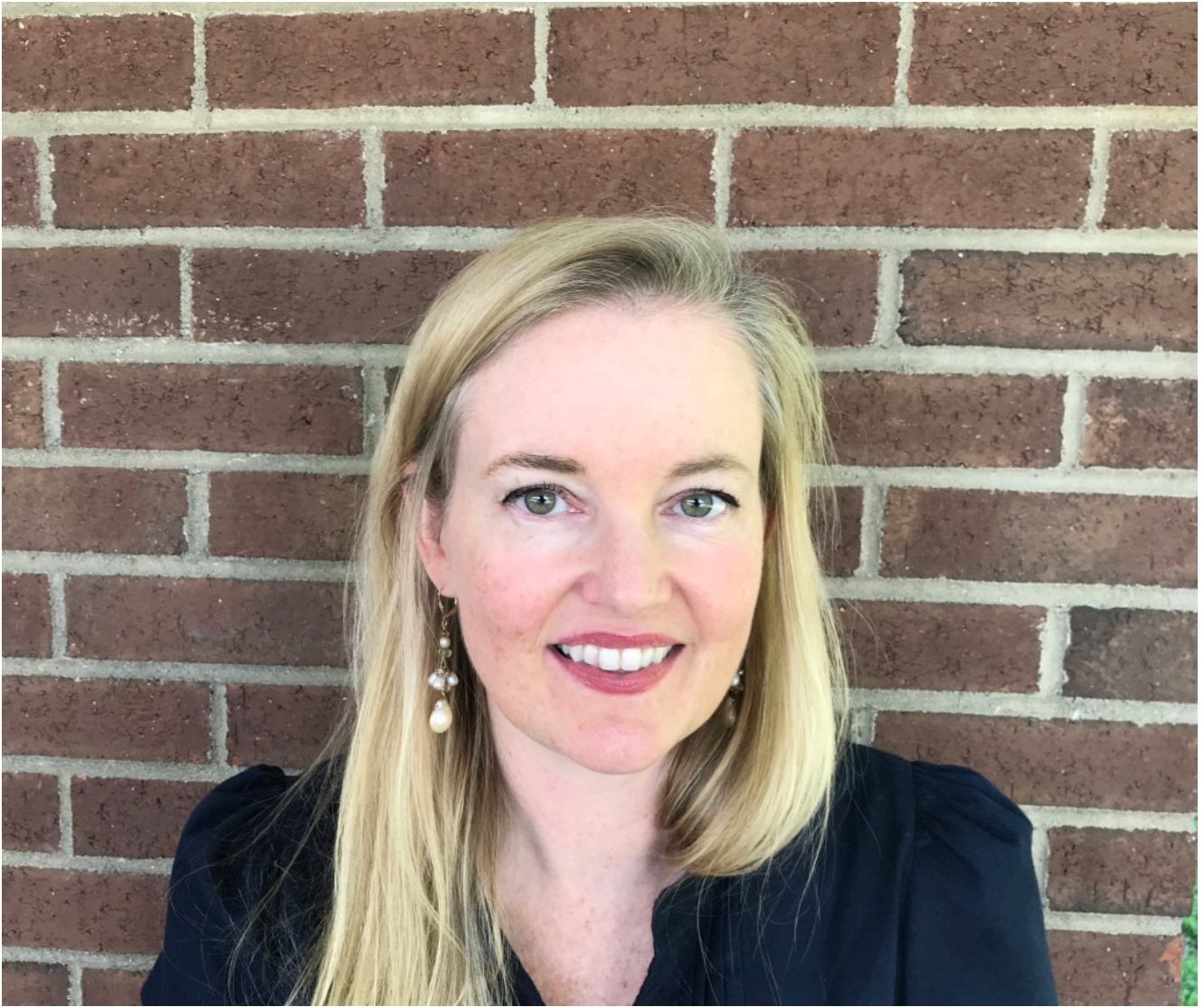
Phil Klay, author of Redeployment and Missionaries , Highland Falls, NY, 2014