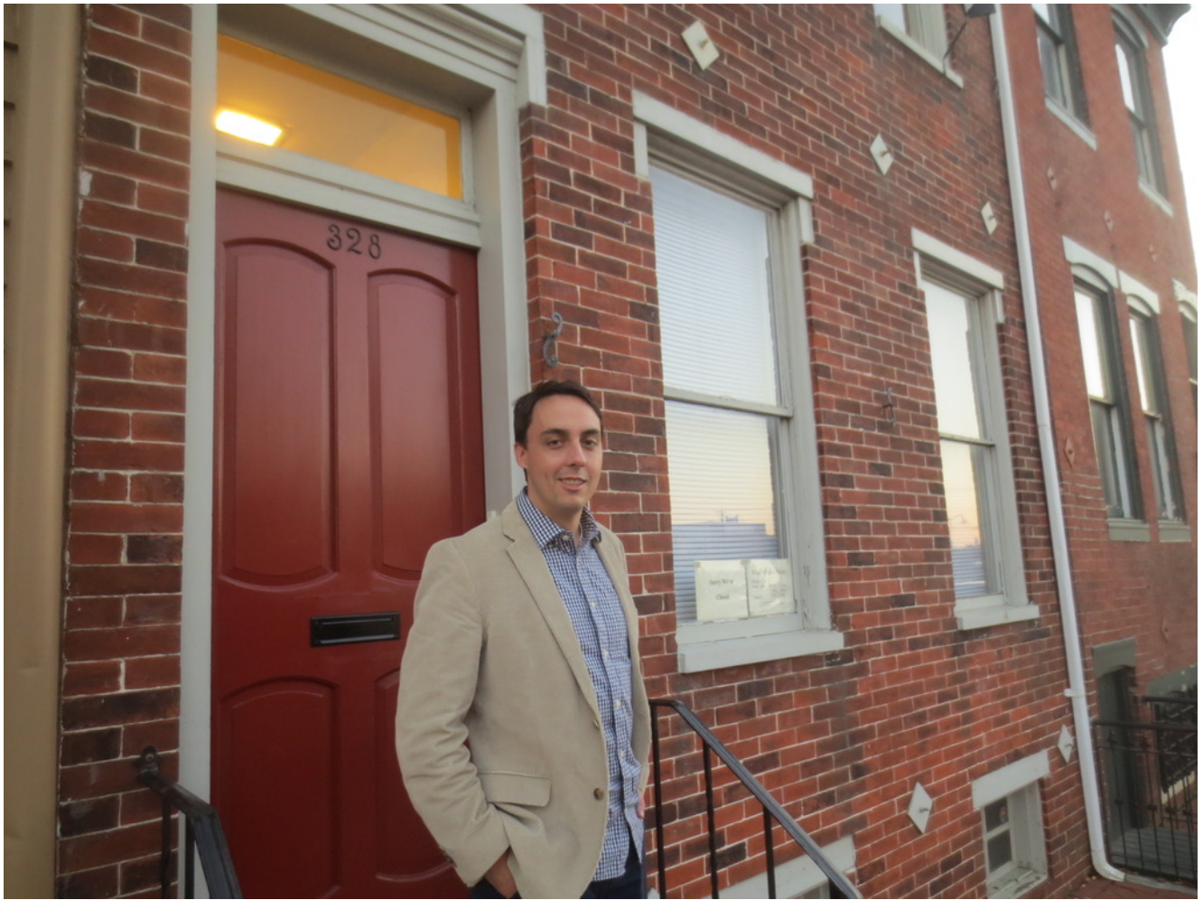
Hassan Blasim, author of The Corpse Exhibition and others, West Point, NY, 2014