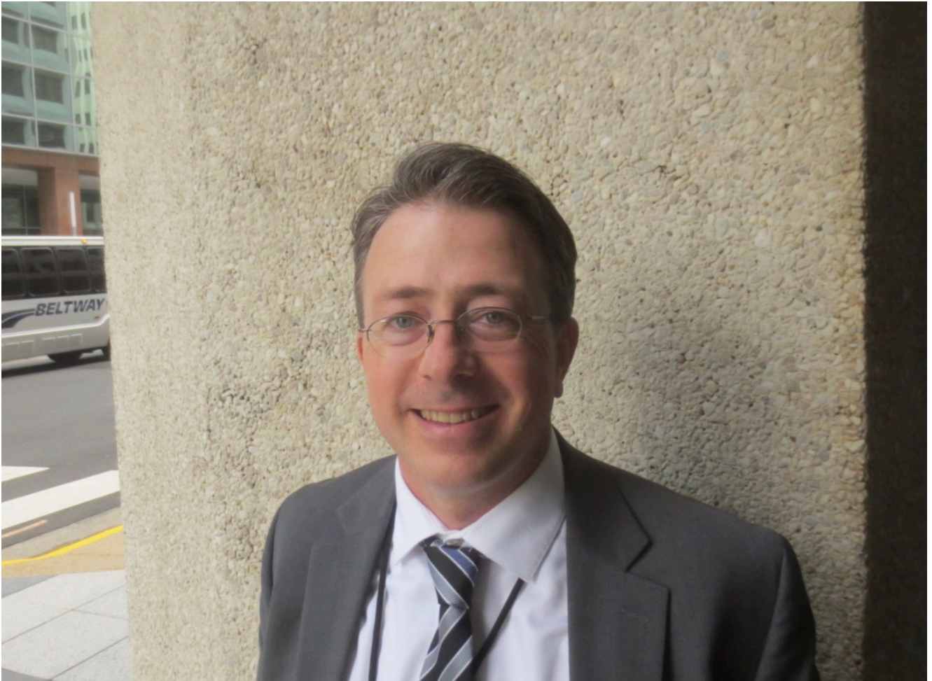
Elliot Ackerman, author of Green on Blue , Dark at the Crossing , and many others, Middletown, CT, 2019