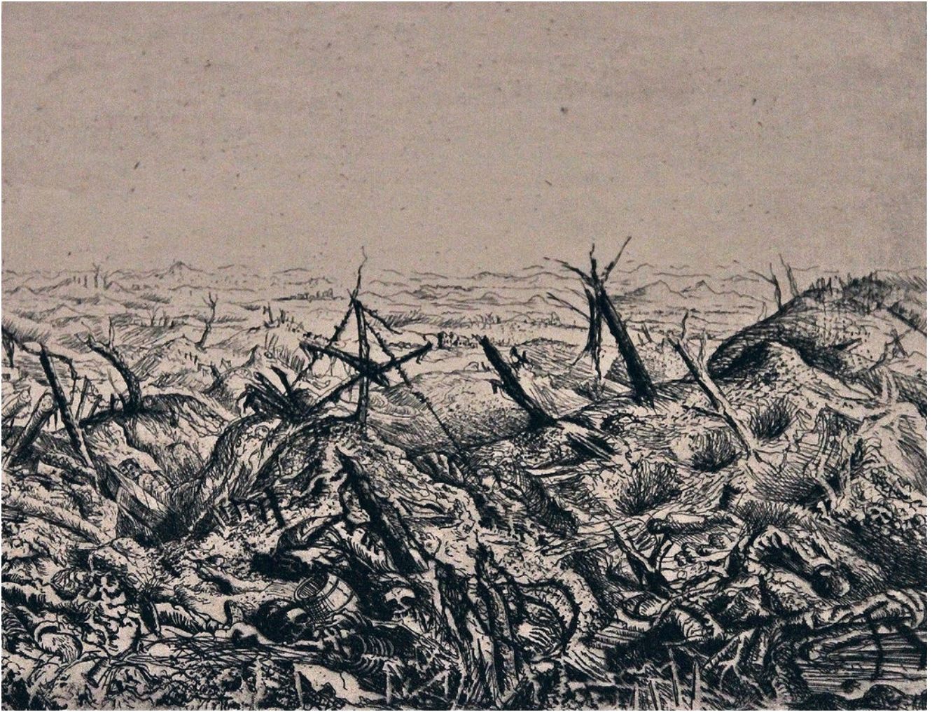
Otto Dix, "Near Langemarck (February 1918)."