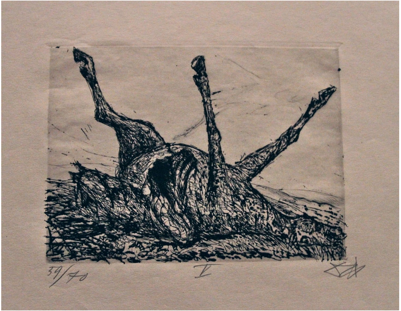
Otto Dix, "Horse Cadaver from the War."

Many times Jackson shows bodies dangling, untended and ignored, from barbed wire, akin to those from the War Triptych or the obviously named but no less striking Corpse on Barbed Wire .