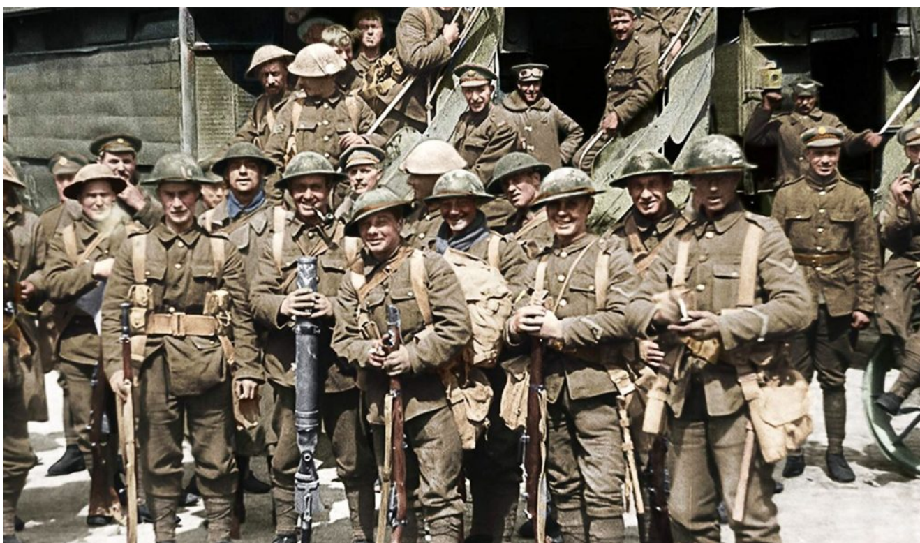
Still from Peter Jackson's 'They Shall Not Grow Old.'

decision to represent the War exclusively from the perspective of the people who actually fought the damn thing, the narrative feels tailored nonetheless. Blame it perhaps on the source material, as the archival audio was taken from something like 600 hours of interviews done in the '50s and '60s by the Imperial War Museums, who clearly have their own version of the War they wish to promote. A version of the war where the sun still has not set on the British Empire, George V regards us all favorably from the wall of every post office, the tea is hot and everyone knows their place.